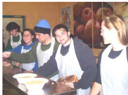
< Students from MSU's St. Peter's Student Parish helped from March 5-8 >Grinnell College students on an alternative Spring Break from the wilds of Iowa helped on March 26 th and 28 th

Volunteers from Michigan State University and Grinnell College in Iowa visited Our Brothers' Place in March. These groups of intrepid Midwesterners helped to clean out the parking lot, serve food, and all-around spread their irrepressible cheer. It worked! Thank you so much, you guys! Come back next year!