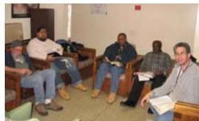
The Friday Bible Study group