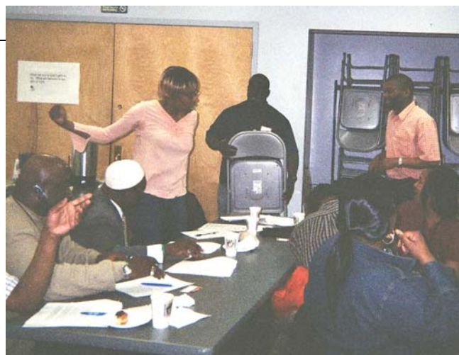
This might look bad, but it's anger management role play in action!

Over the past month, our staff members have participated in trainings on understanding homelessness, communication and anger management. The staff members who attended made very positive comments and expressed appreciation for the opportunity to see fellow staffers from other sites. One staff member wrote that “it was good to hear different views and see how other people care.” Another said, “I enjoyed working together as one and understanding each other better.”